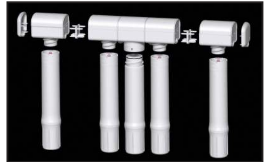
This drawing illustrates some of the customizable filter connection options the ERO 375 has to offer. Additional filter(s) may be added on to either side of standard unit.