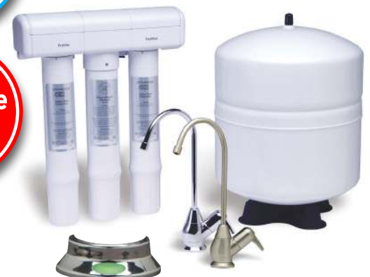
OPTIONAL Electronic Monitoring Faucet Base