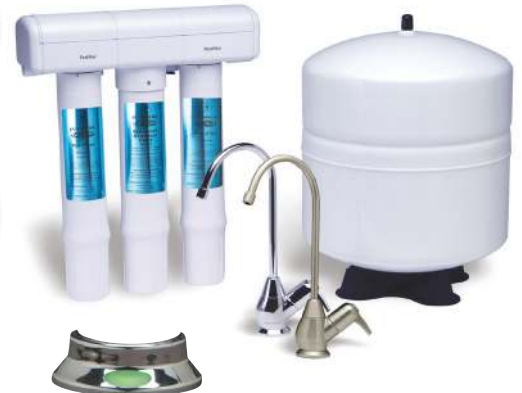
OPTIONAL Electronic Monitoring Faucet Base